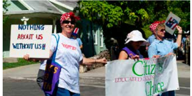
Our message in the annual Constitution Day Parade

promotes reproductive justice through education, health care access, and advocacy. We are grateful for the continuing support of the western Nevada County community since 1989.