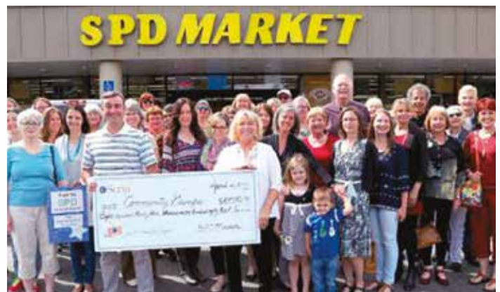
EScrip program with the SPD, Grass Valley.

We are passionate about our mission: To promote reproductive justice through education, healthcare access, and advocacy. We exist to inform and enable choice.