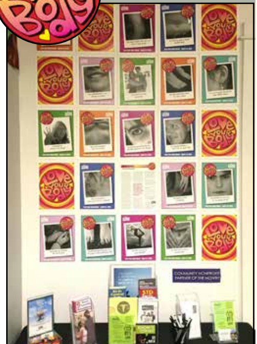
Citizens for Choice is grateful for being voted Center for The Arts Non-Profit of the Month this April, and we hope you enjoyed our display!